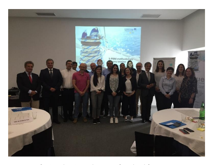
The \ Steering \ Committee \ members \ in \ Lisbon

Concerning the WP2 Communication, UNIUD presented the current state of videos to promote the project and defined the final deadline for their realization.