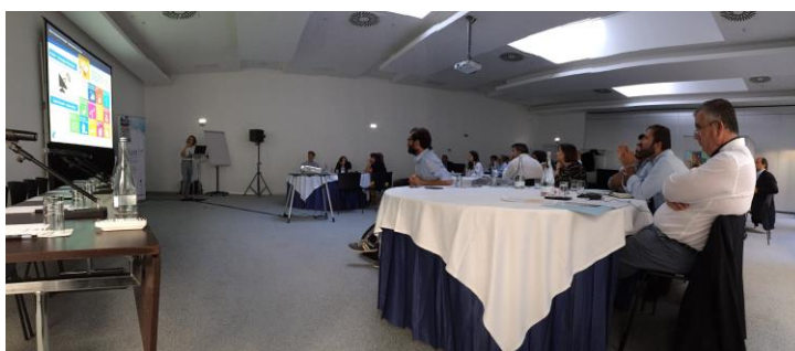
The audience of fourth iBLUE thematic seminar in Lisbon and the iBLUE team