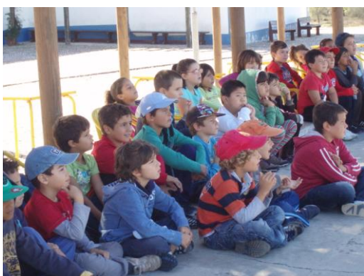
One of the 10 groups at Monte do Paio

The municipality of Santiago do Cacém is also involved and provides transportation for the students.