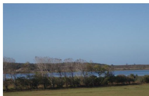
The Santo André Lagoon at Monte do Paio

After two field days, each group meets again, at the third month, at the Nature Reserve to present to the students of the other school the materials they have developed in class and to share experiences.